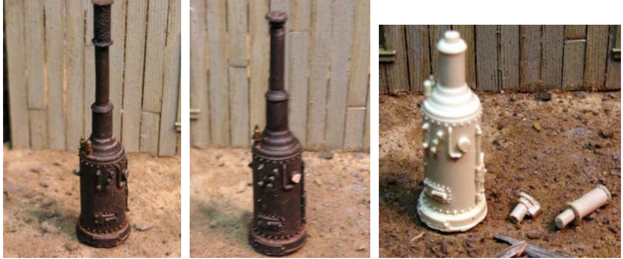
RRSP-H-02 Large steam boiler, you get one boiler and small metal tube and two tops. One top is a spark arrestor and the other top is a flip top to keep the rain out. Price is $5.00